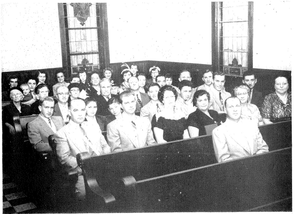
Senior and Primary Sunday School Departments